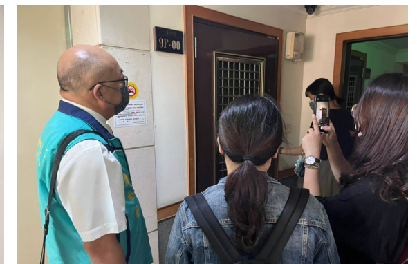
Upper right and lower left images display media briefing for SRHSM Scheme launch.